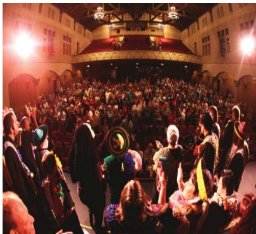
Standing ovation for Beau Monde Float performance at the Plummer Auditorium in Fullerton.

With funding support from several grants, we created “Beau Monde Float”, a multi-media performance piece. This gave our students the great experience of working with a team of professional performers (MLuM), and presenting a production in a high tech theater. The piece was created from interactions between our students and MLuM. After a two year period of planning and rehearsals, it came together. The students, staff and MLuM members were so elated, they not only plan to repeat this performance, but hope to work together again on new projects.