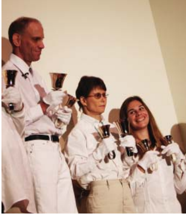
Handbell players perform.