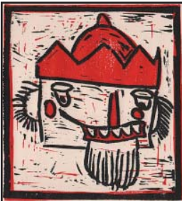
"Nutcracker" Linoleum block print by Ron Langloe