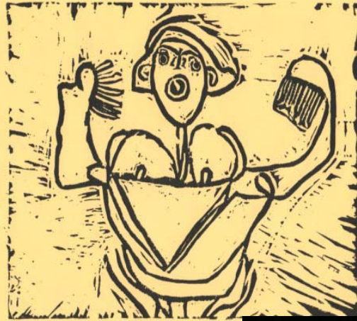
Linoleum block print by Miguel Aldaz "Arnold as a Bodybuilder" chosen for the Laguna Beach Festival of the Arts.

We encourage everyone to visit the exhibition in Laguna Beach to see the work of some of our Hope University artists. The exhibition runs from July 6th – August 31st, and is open from 10a.m. – 11:30p.m. daily. General admission is $7; $4 for seniors and students. All general admission tickets to The Festival of Arts are season passes. Patrons are encouraged to make repeat visits. Laguna Beach residents with ID receive free admission, as do children under the age of 12. Laguna Beach Transit provides free trolley service from various parking areas in Laguna Beach (parking is $7 - $12 for the day), which makes it very fun and easy to attend.