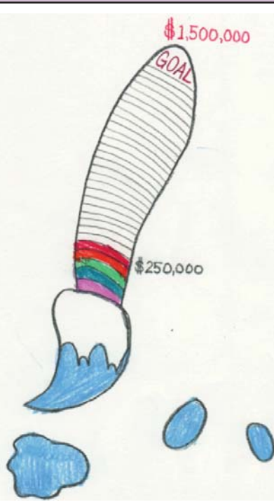
Help us reach our goal of a new building!

Hope University transforms the lives of adults with developmental disabilities through the arts.